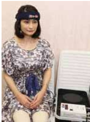
Ultra-Ma ultrasonic irradiation device (cranial)

The 30-kilohertz ultrasonic waves emitted by the Ultra-Ma are at a frequency inaudible to human ears, and these waves provide gentle stimuli to help preserve bodily health. Just like when dolphins communicate with each other underwater using ultrasonic waves, the Ultra-Ma emits low-frequency vibrations that place no stress on the body.