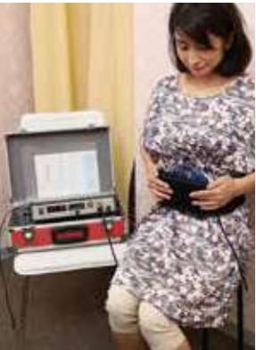
Ultra-Ma ultrasonic irradiation device (body)

A pair of 30-kilohertz ultrasonic acoustic vibration devices are affixed to the sides of the frontal cranium area (forehead), and musical vibration devices are affixed to the left and right sides of the head.